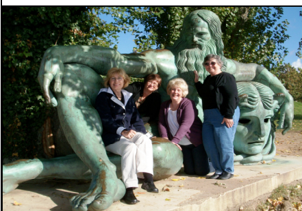
Gals with Leonardo da Vinci