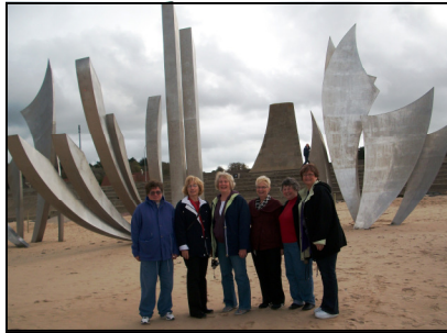
WWII Memorial on Omaha Beach

hi-light of our trip. We then visited the beautiful Cathedral of Notre Dame after church services were dismissed. Sunday, we set off for the Normandy Coast and visited the Memorial Peace Museum, the American Airborne Museum and all five beaches; Omaha, Utah, Gold, Sword and Juno. The German and