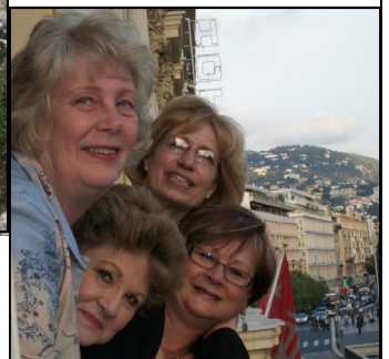
Fun in the French Riviera!